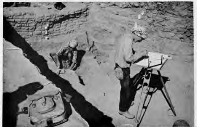
Mapping in the tried and true way, using a plane table and an alidade that dates from 1922.