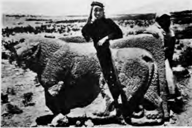
"Hittite" lion orthostat (sawed in half), photographed by T.E. Lawrence in 1911, near the "Lion Gate" of Harran.

No king was more devoted to the Sin cult than the renegade ruler of the Neo-Babylonians, Nabonidus. His beloved mother was a devotee of the Moon in Harran. Nabonidus installed his daughter in the Sin Temple at Ur.