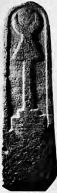
"Sin of Harran" symbol with Crescent Moon, carved in basalt.

to set off with his armies for Egypt, he visited a "temple of cedarwood" in the vicinity of Harran: