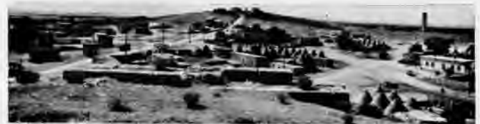
The tell of Harran (background, center) and the minaret (right) looking northwest from the "castle".